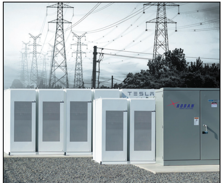
Tesla Battery Storage

Rodan Energy is a North American leader in demand-side management solutions for large electricity users. We can reduce your total energy expenditure by integrating power systems, controls, and peak advisory technology that will maximize demand response revenues along with savings from peak shaving opportunities.